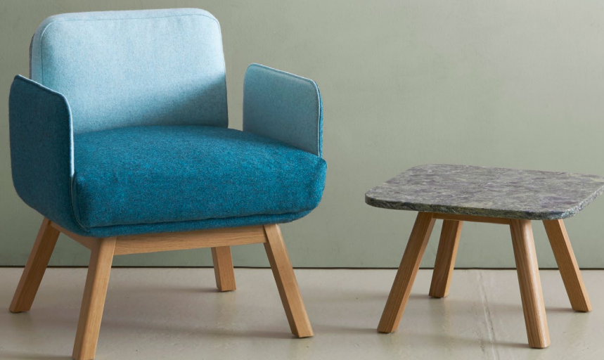
hm10j low arm chair with 10y3 table