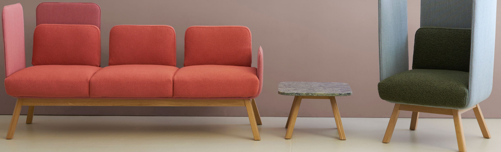
hm10w 3-seat sofa with mid-back, 10g high-back/side chair & 10y3 table

In 2015 Ineke moved back to the UK to set up studio-salon: design studio & research salon. From London she works with her studio in Holland on design projects for leading international design manufacturers and with the salon she explores 'the future of furniture design' and 'the changing position of the designer'. hm10 FLIX is her first collection for Hitch Mylius.