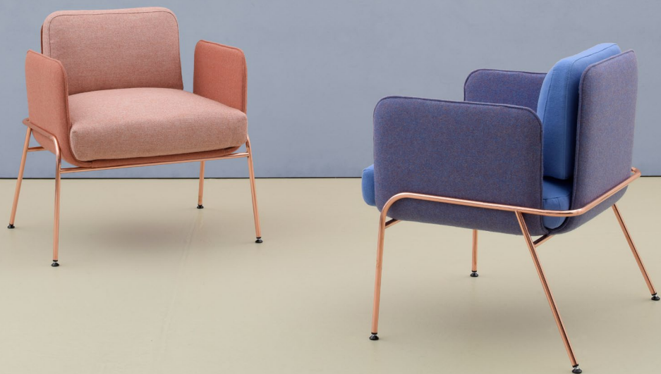
hm10f low arm chair