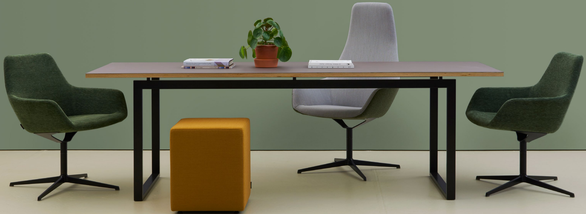
hm107c table with hm86a4 and f4 chairs and hm51a1 cube