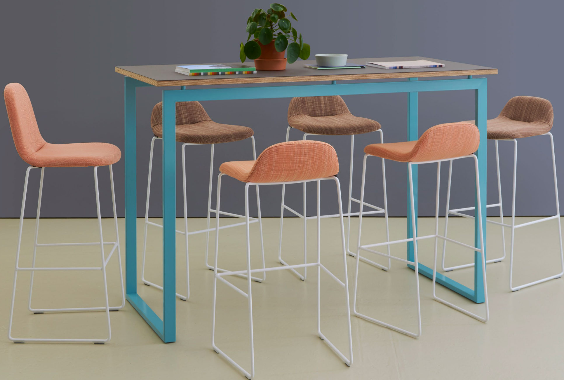
hm107d high table with hm58j and k barstools