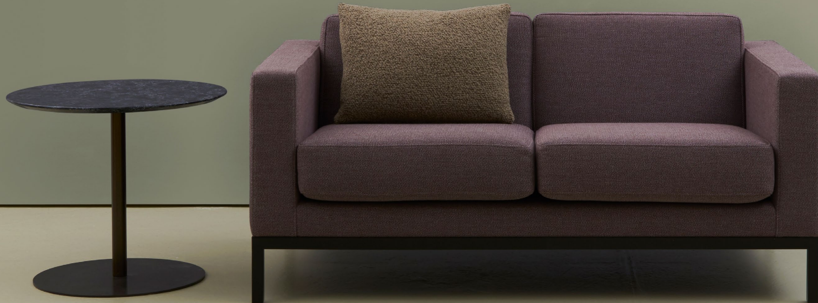
hm26b 2-seat sofa and hm20f table