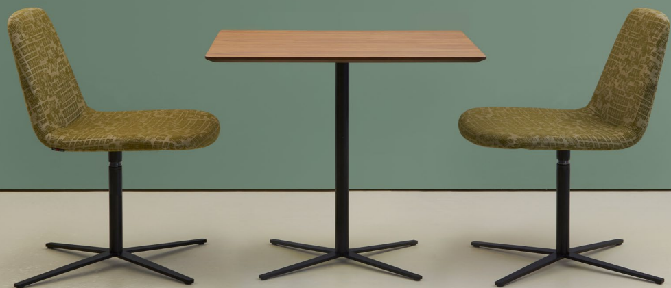
hm58e swivel chairs with hm57f table