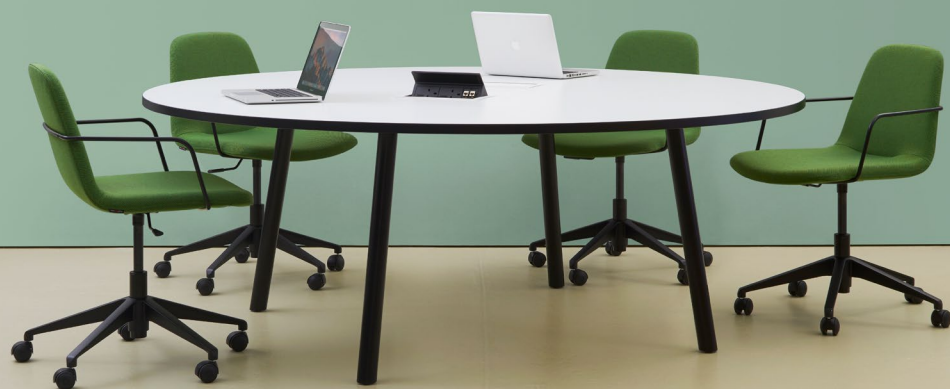
hm58i swivel armchairs with hm21b table