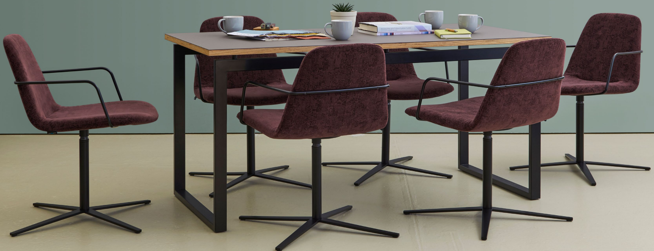
hm58f swivel armchairs & hm107a table