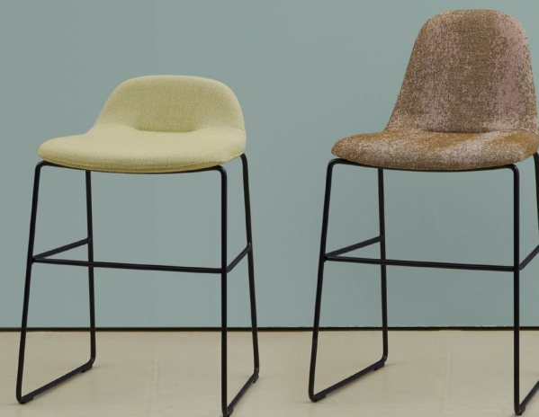
hm58p and q counterheight barstools