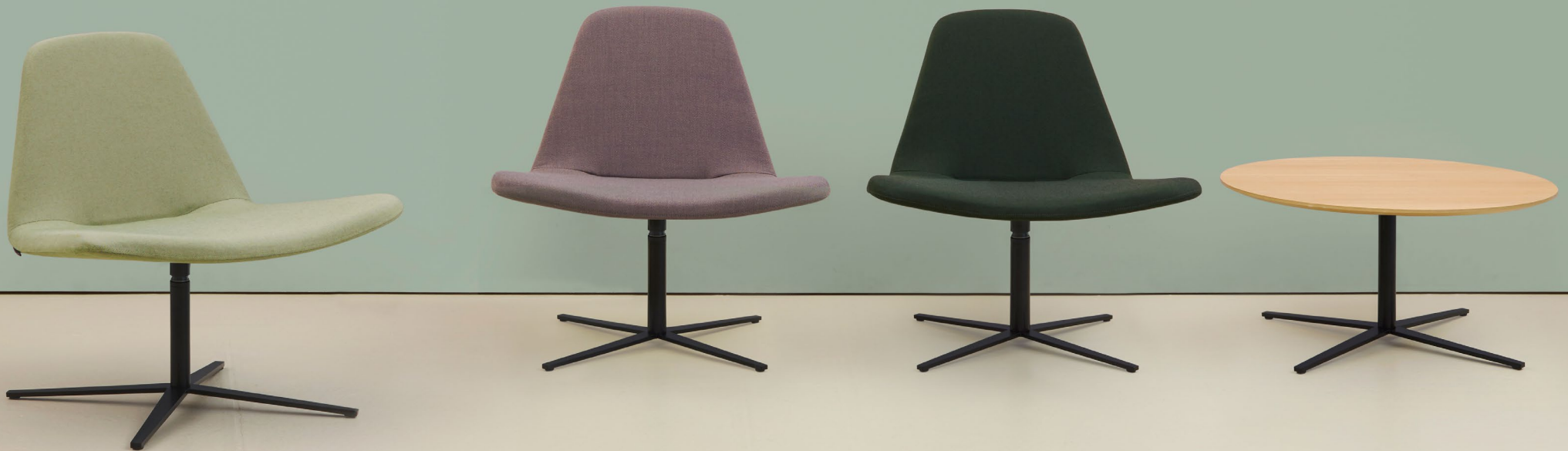
hm59c lounge swivel chair with hm57k side table