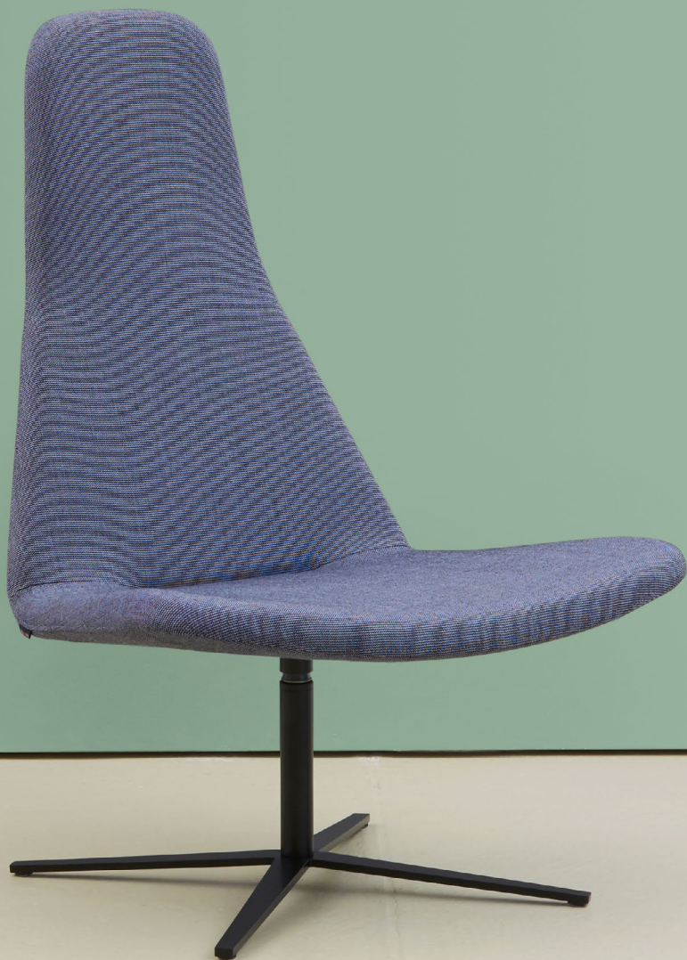
59g high-back swivel chair