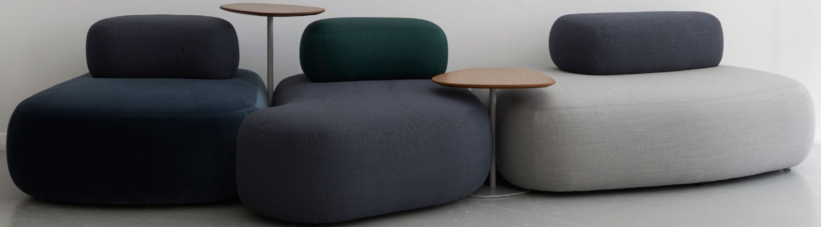
hm63a, b and c with h and j tables